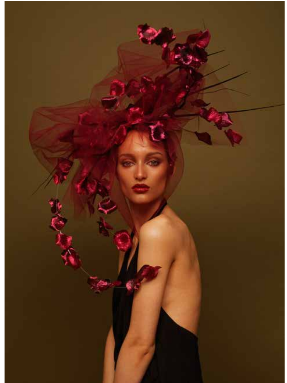
Petal Shower AW1501