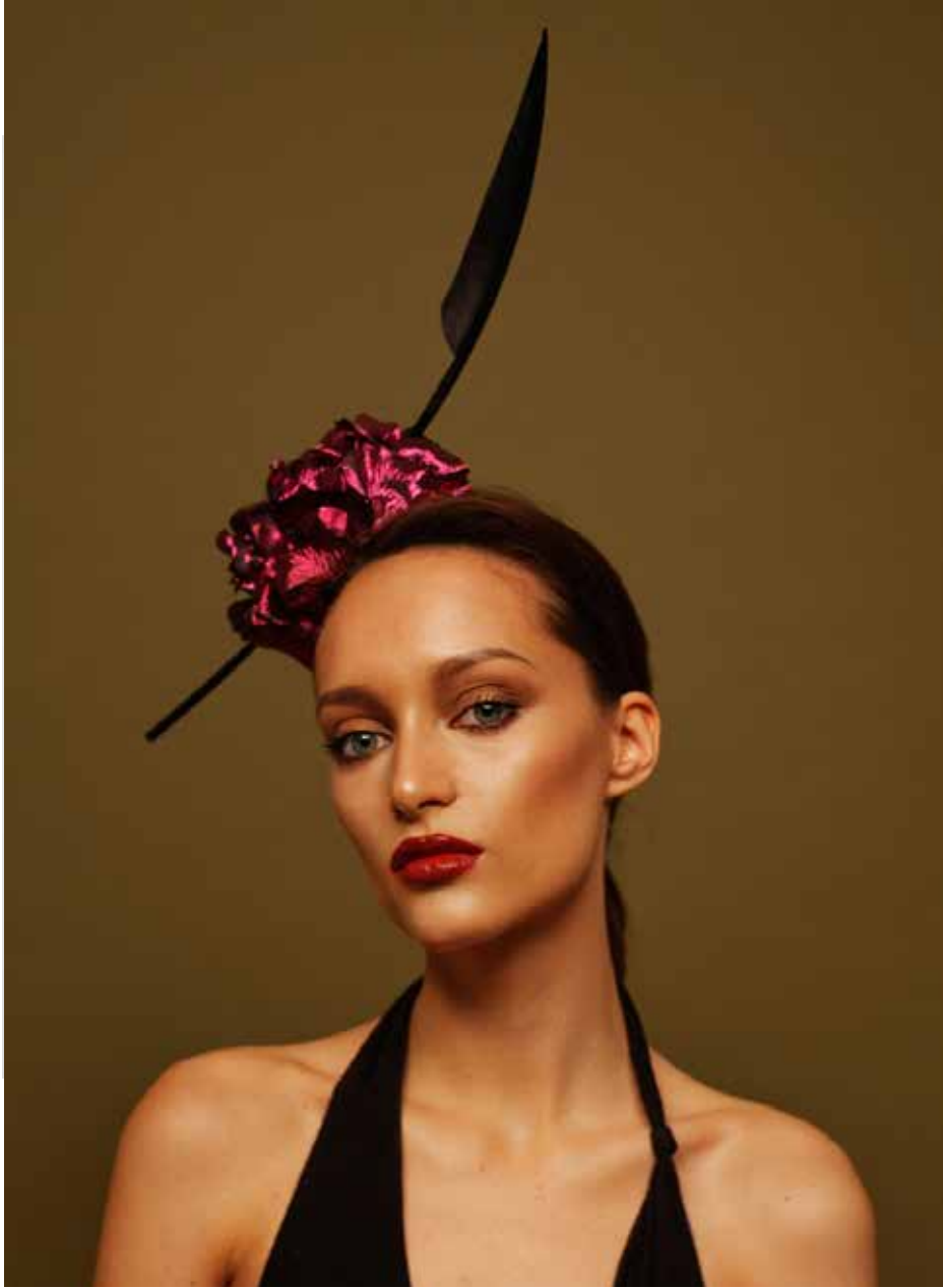
Petal Bomb AW1504