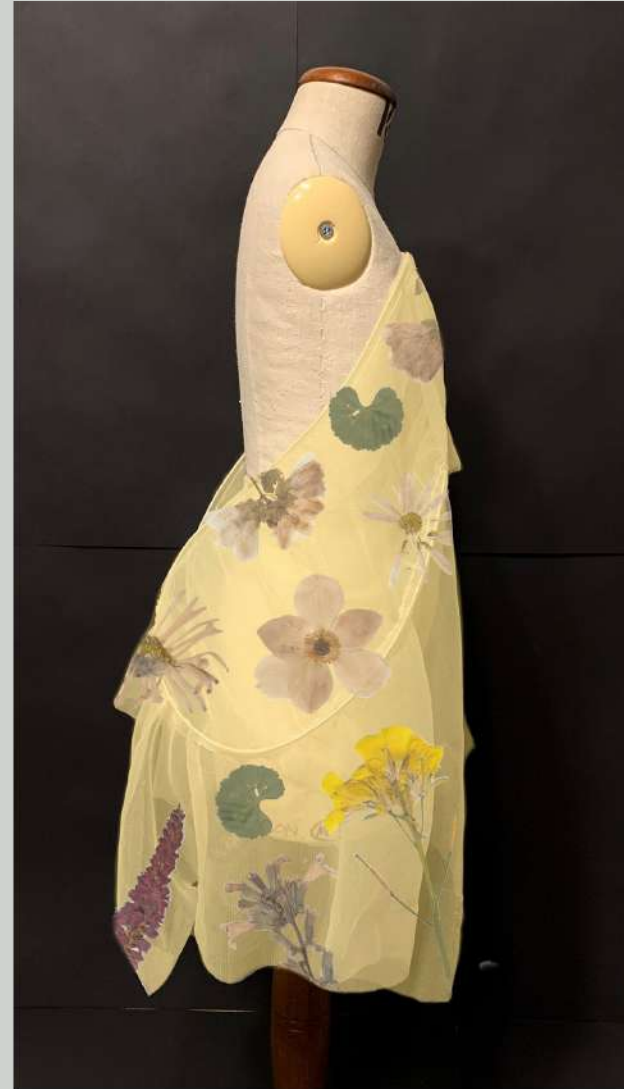
Looking at pressed flower print positioning and colours inspired by Joe Horner.