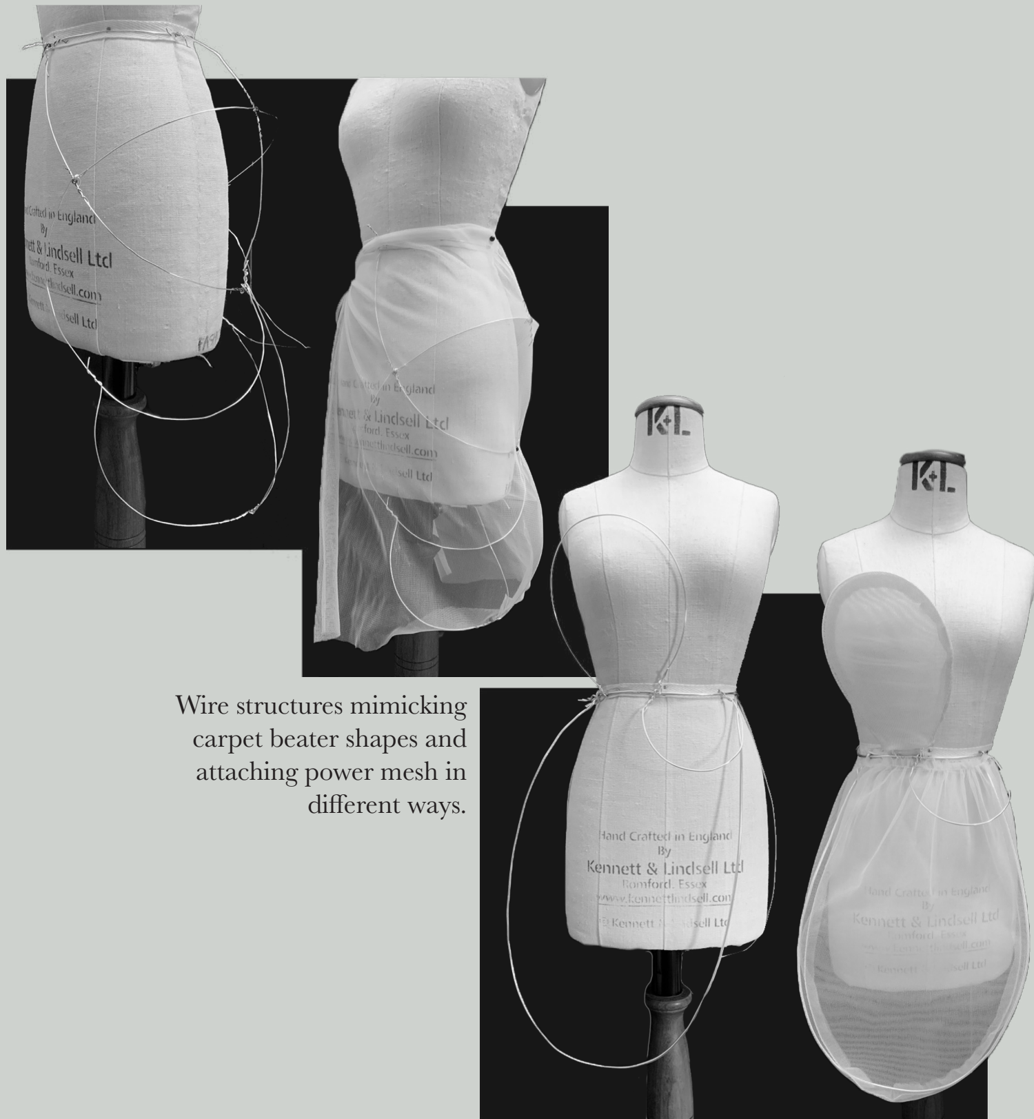
Wire structures mimicking carpet beater shapes and attaching power mesh in different ways.