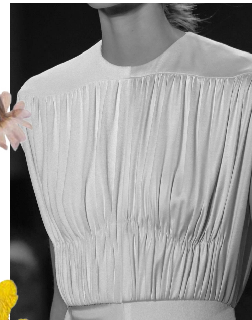
Derek Lam AW16