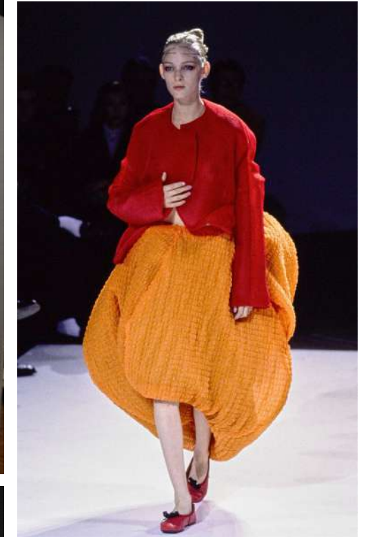
Comme des Garçons SS97