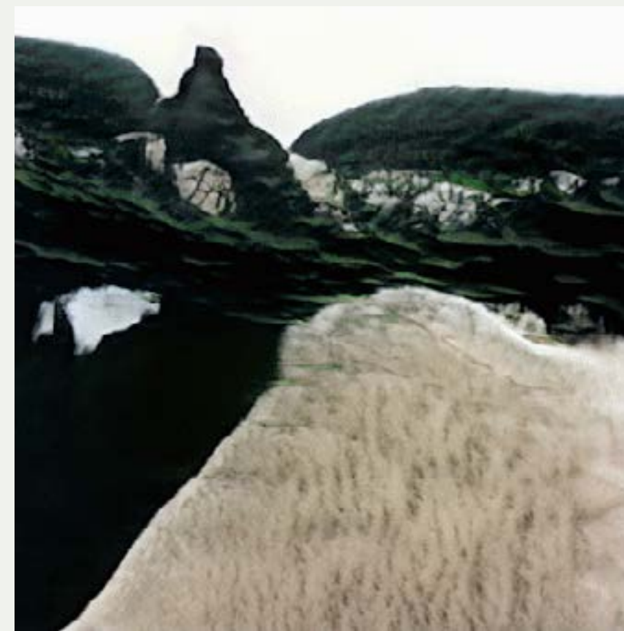
GRN Style 2 Landscapes