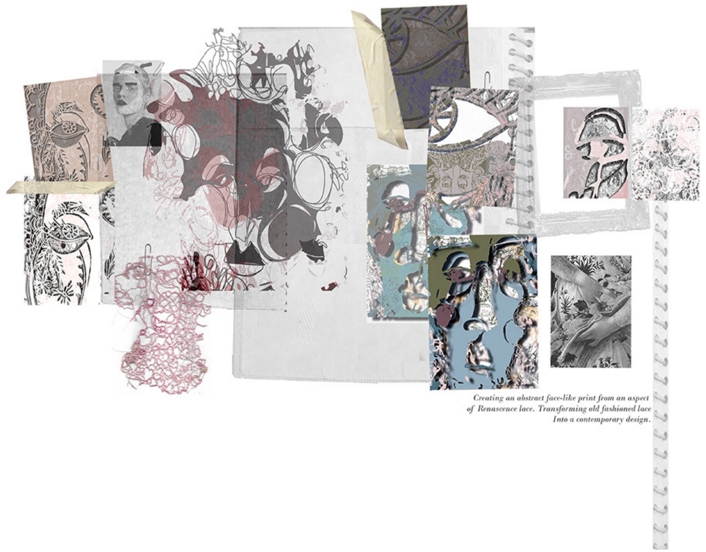
Creating an abstract face-like print from an aspect of Renaissance lace. Transforming old fashioned lace into a contemporary design.