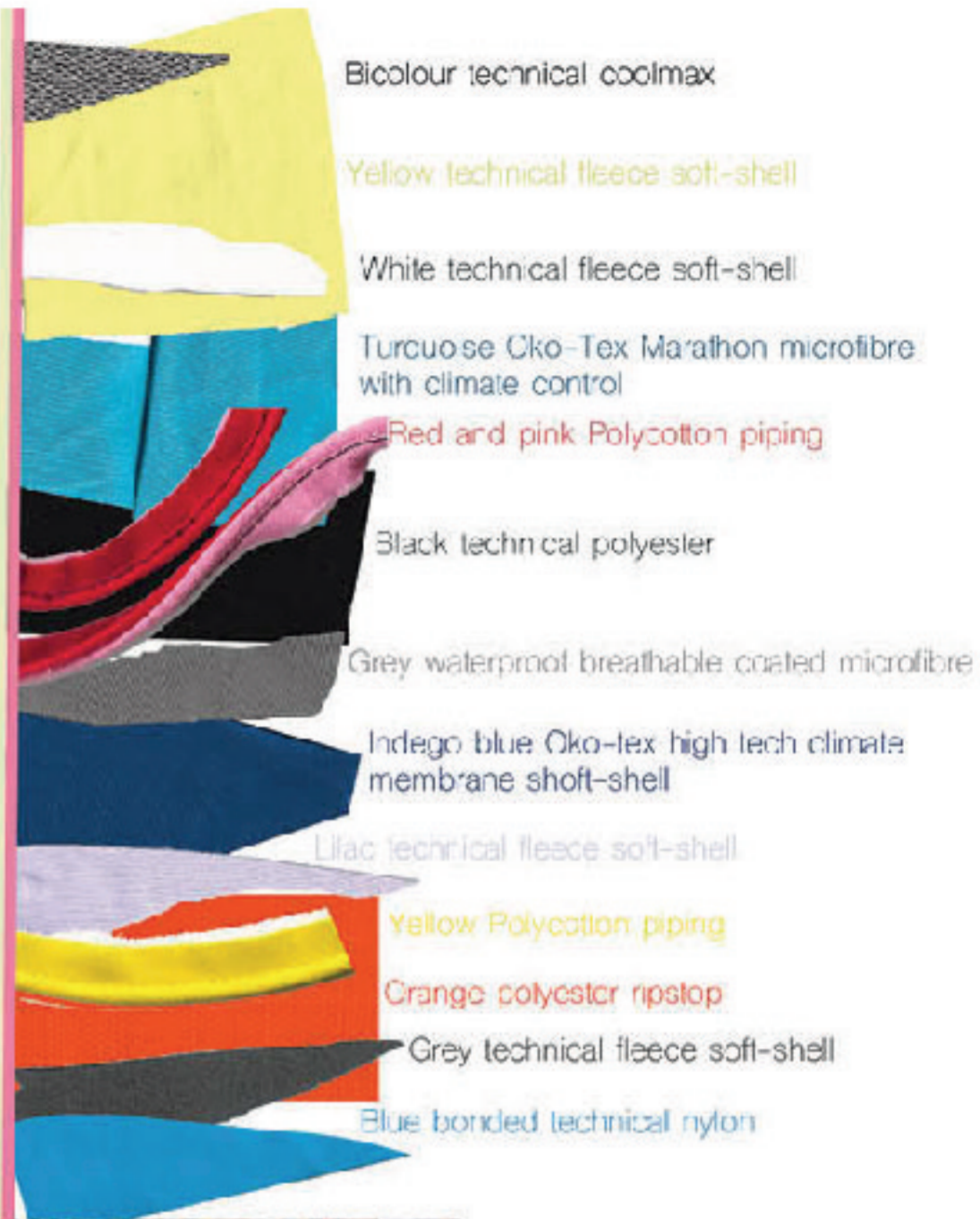
Bicolour technical coolmax