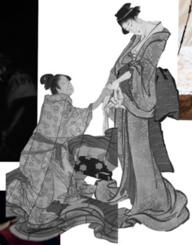
WOODEN PAINT OF WOMEN IN KIMONO, JAPAN