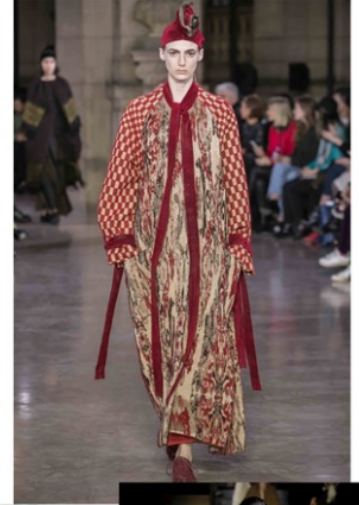
UMA WANG COLLECTION