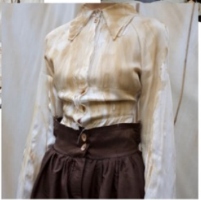
PENG TAI SEASON VII WOOD PROJECT