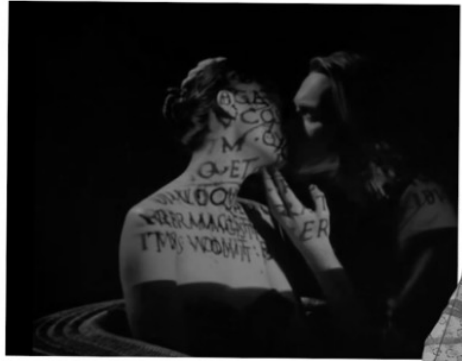
THE PILLOW BOOK (1996)