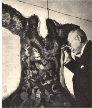
JAPANESE TATTOO COLLECTION