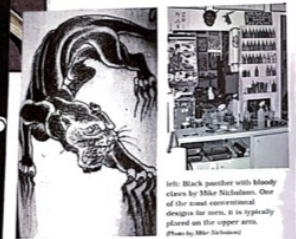
left: Black panther with bloody claws by Mike Nicholson. One of the most conventional designs for men, it is typically placed on the upper arm.