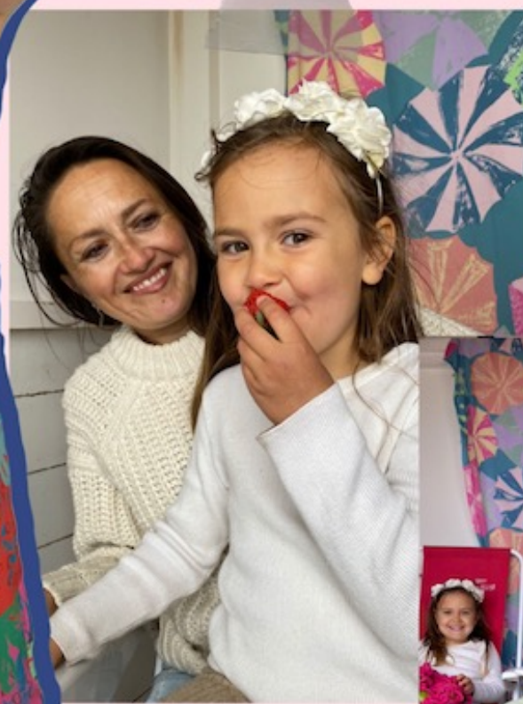
in the beach hut