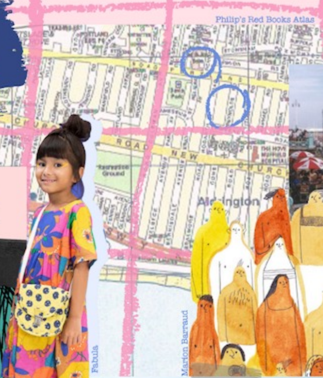
Philip's Red Books Atlas