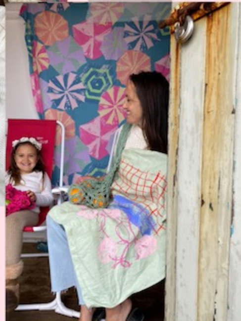
mummy & me