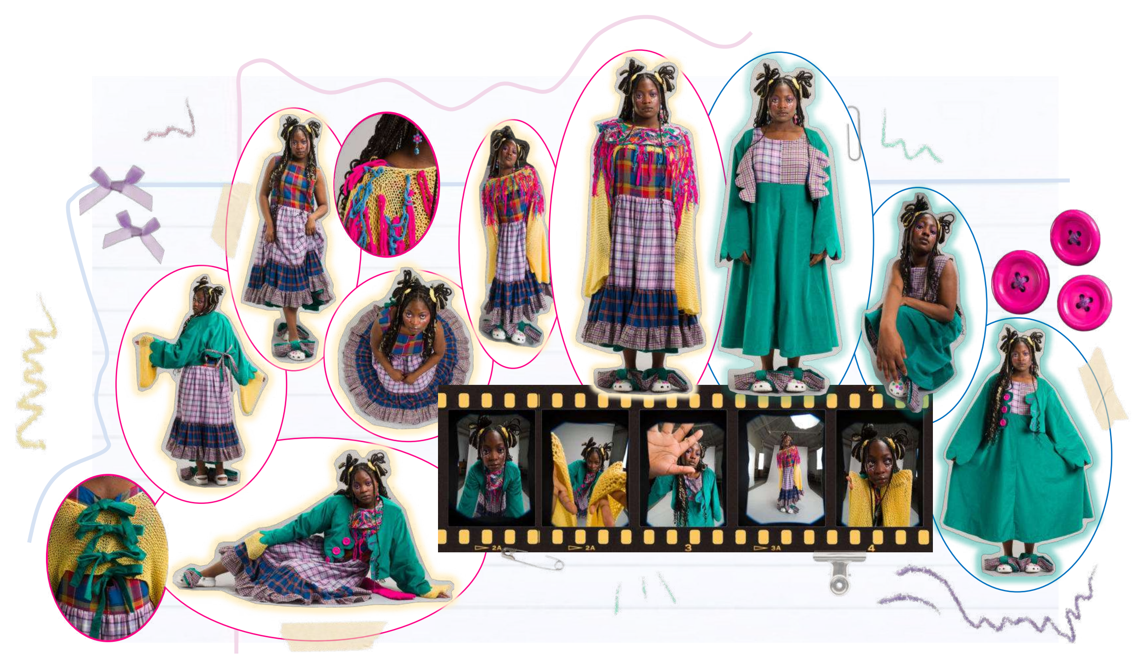
Outfit 1, Professional Photoshoot