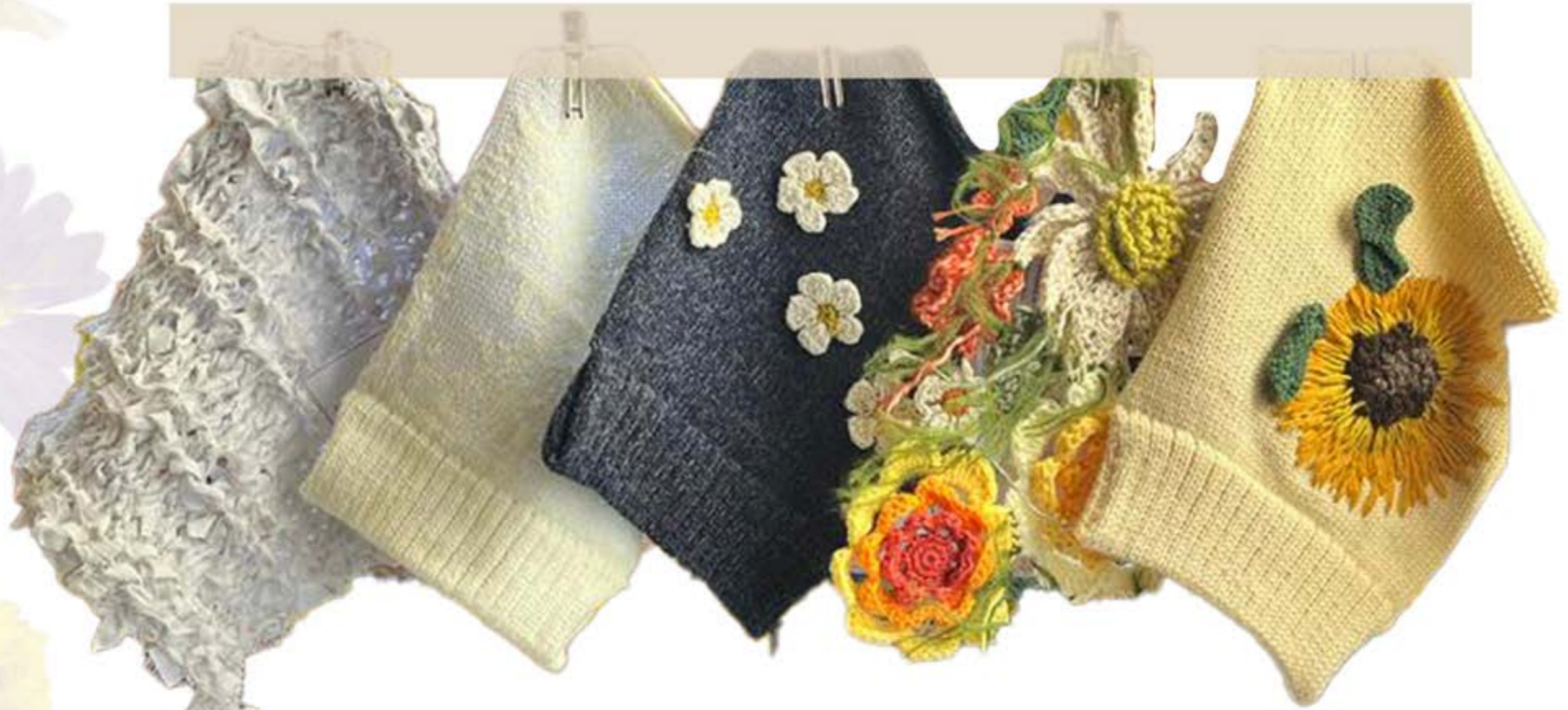
Fabric Board #1