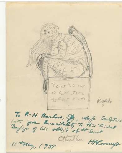
Drawing of Cthulhu by H. P. Lovecraft