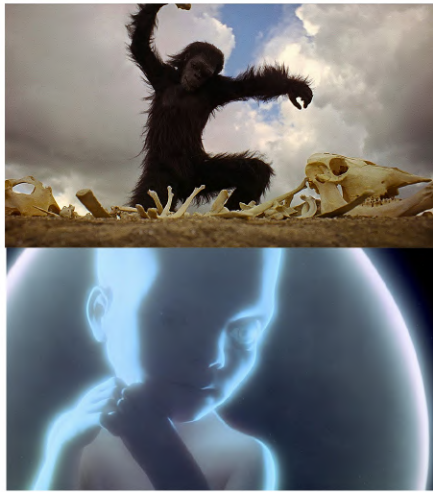
2001: A Space Odyssey