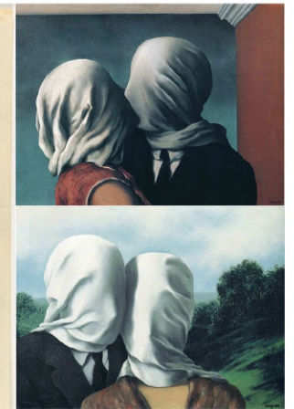
René Magritte, The Lovers, 1928

I have a keen interest in how humanity will exist in the future. I inspired by The Matrix and the grand narrative of 2001: A Space Odyssey , it is foreseeable that the virtual world will develop greatly in the future, and if the future is a situation where the virtual world and the real world are overly superimposed, can we liberate ourselves from the definition of humanity in another world? Can we achieve a continuously fluid identity? I also refer to the concept of Donna Haraway, she uses "Chthulucene" for a vision of the world in which there is no hierarchy between humans and nonhuman animals, where instead all lives are interwoven. At the same time, from my fashion background, The mask is the element I am most interested in, it brings the unknown and the possibility. These investigations build up the basic worldview of my work.