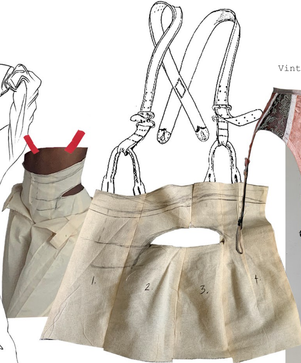
Vintage suspenders- source piece