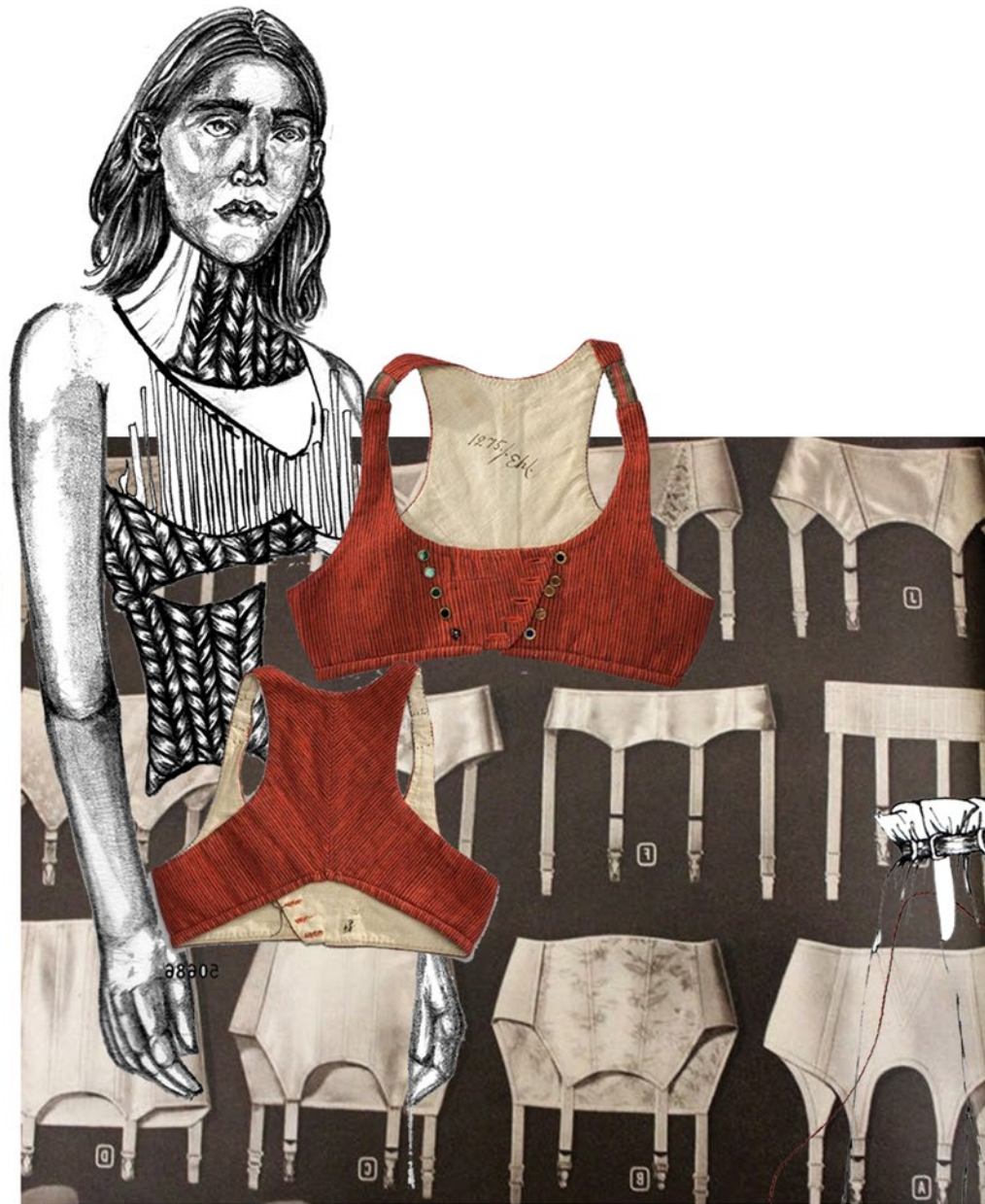
'1957 VOGUE' Corset trouser waistband development