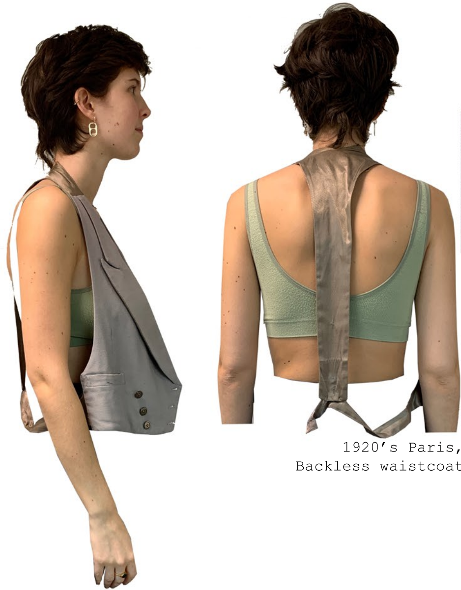
1920's Paris, Backless waistcoat