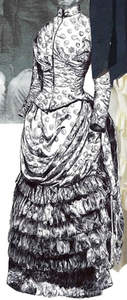
V&A 19th Century ball gown