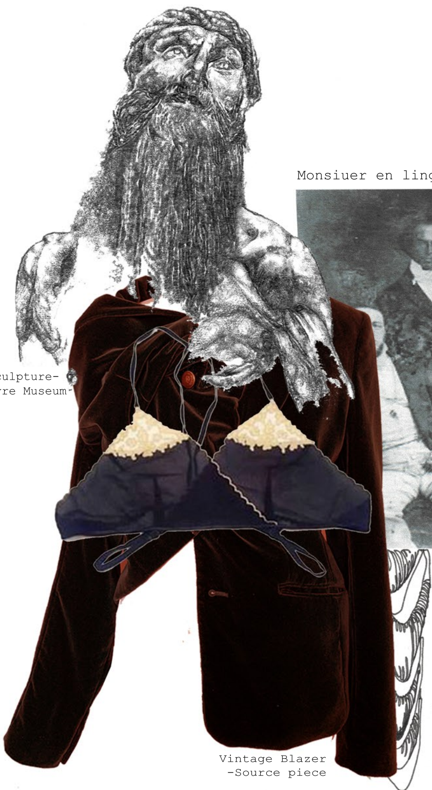
Portrait of 'French man' sculpture - the Louvre Museum