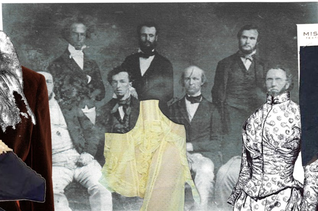
Monsiuer en lingerie - Gentleman in lingerie